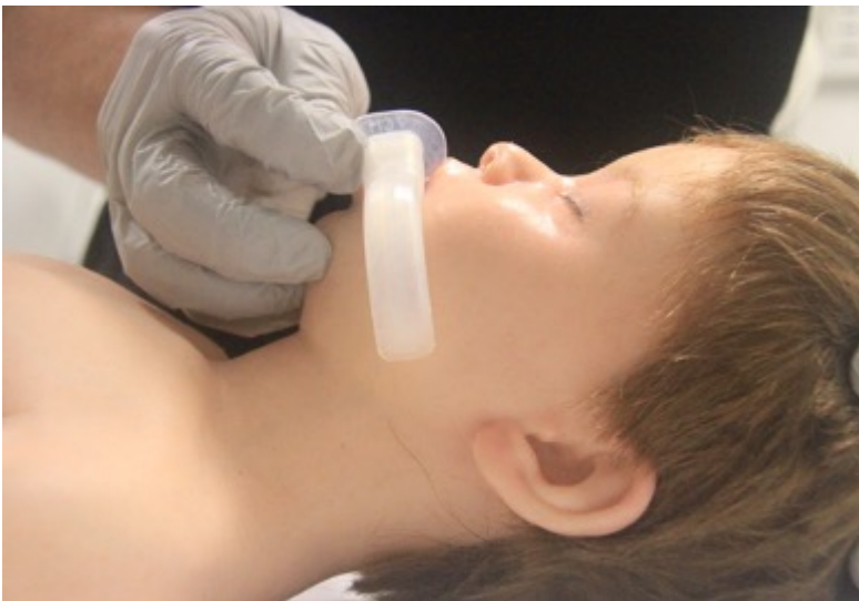
Figure 5: Sizing of oro-pharyngeal tube