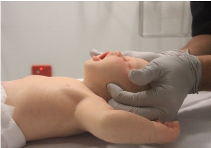
Figure 3: Jaw thrust in an infant