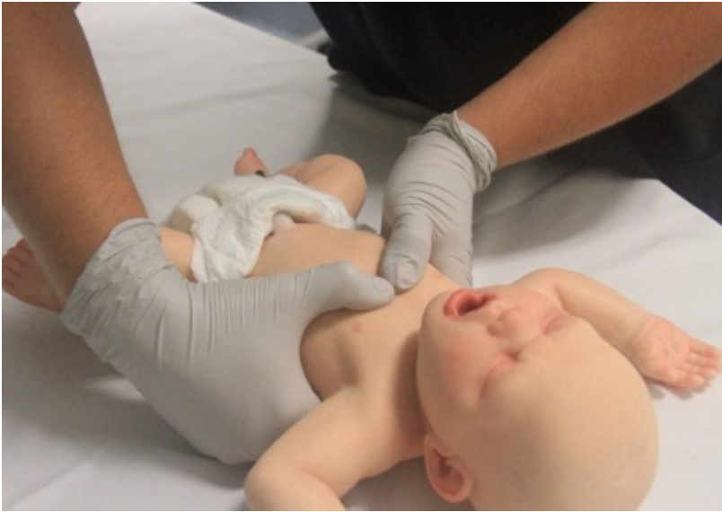
Figure 8: Two-thumb compression technique in an infant

technique, the rescuer's hands encircle the chest and the thumbs compress the sternum. Care should be taken to avoid restricting chest expansion during inspiration. The two-finger technique (Figure 9) may be preferred by a single rescuer to minimise the transition time between chest compression and ventilation [Good Practice Statement].