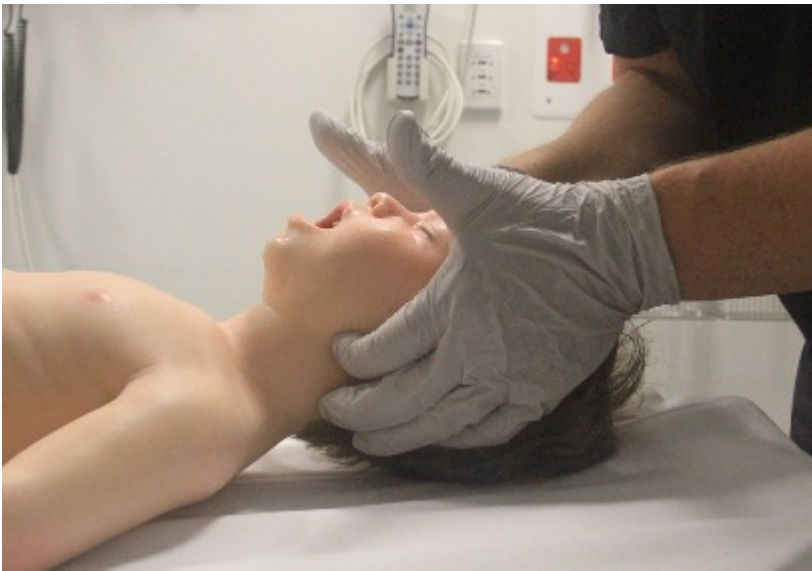
Figure 4: Jaw thrust in a child