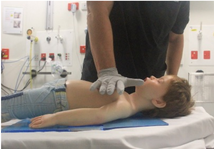
Figure 10: One-handed compression technique in a child

Approximately 50% of a compression cycle should be devoted to compression of the chest and 50% to relaxation to enable full recoil of the chest wall.