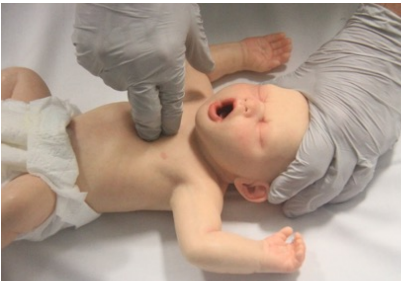
Figure 9: Two-finger compression technique in an infant