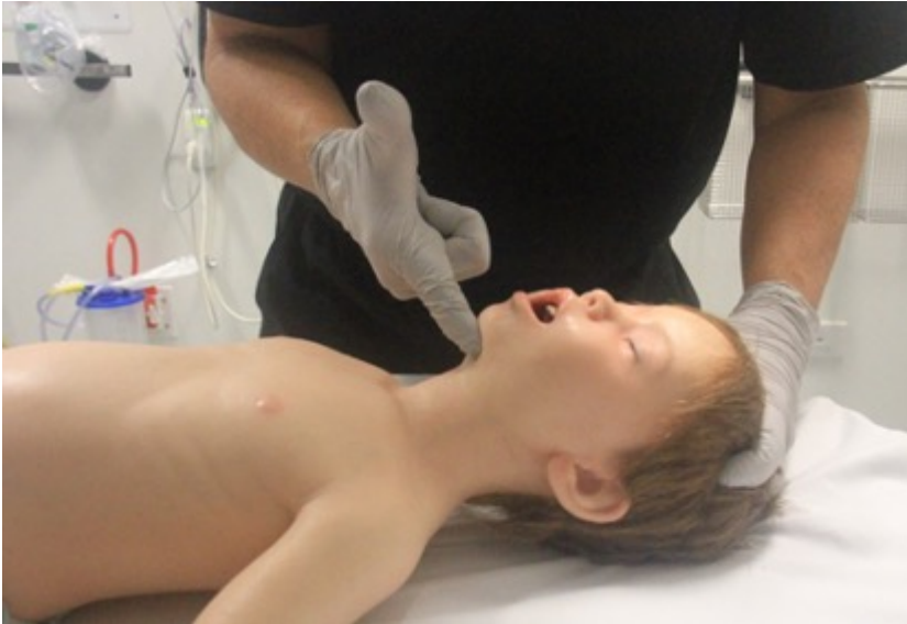
Figure 2: Head tilt with chin lift in a child (sniffing position)